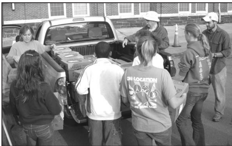
Pictured above is a group of youth from last summer taking produce to local senior citizens.

partnering with East Lake UMC's Farmers Market Basket Program