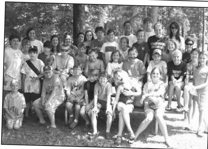
Day Camp 2009

*Must register by July 1 to be guaranteed a T-shirt and to request friends to be placed in the same class.